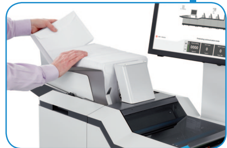
High-Capacity Envelope Feeder