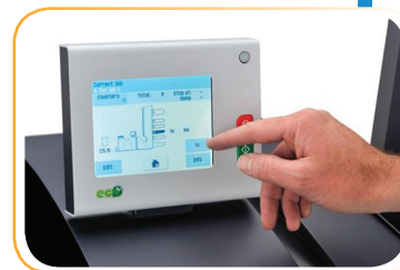
Color Touchscreen Control