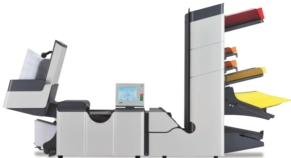
6404 Series, shown with High-Capacity Document Feeder, optional Short Feed Trays, and optional High-Capacity Production Feeder