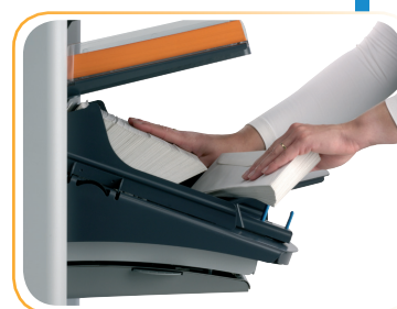
Optional Production Feeder