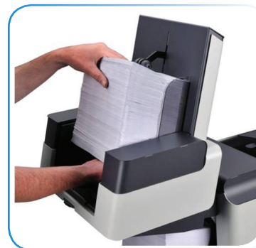
High-Capacity Vertical Output Stacker